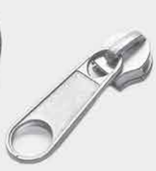
N106 E2614 10 S non lock