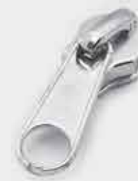
N56 E002 58 S non lock