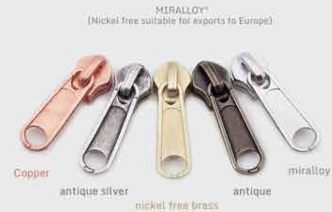
Copper antique silver nickel free brass antique miralloy

MIRALLOY® (Nickel free suitable for exports to Europe)