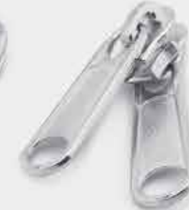
N74 E155 6 S double puller