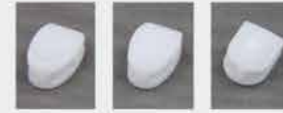
N36 Mouse S40 mouse N36 for quilt cover