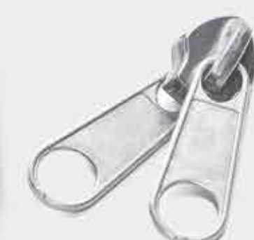
N104 E2614 10 S double puller