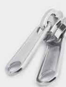
N84 E155 7 S double puller