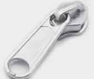
N86 E155 7 S non lock