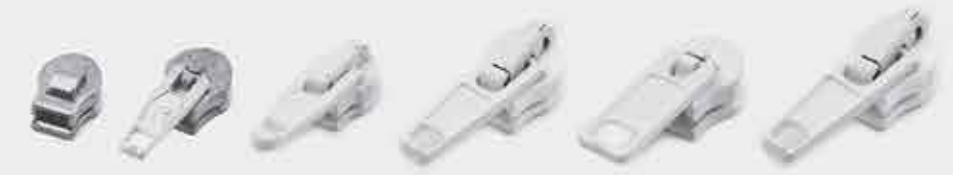
N36 N33 4 S pin lock N31 4 S auto lock N51 58 S auto lock N53 58 S pin lock N71 6 S auto lock