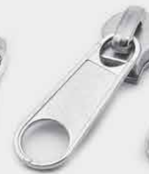
N96 E2614 9 S non lock