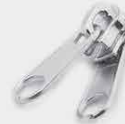
N54 E002 58 S double puller