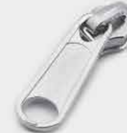
N76 E155 6 S non lock