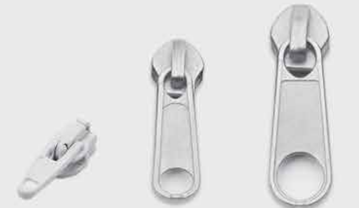
N31 9052 (PAINTED) N86 E155 (PLATED) N96 E2614 (PLATED)