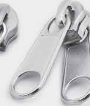
N94 E2614 9 S double puller